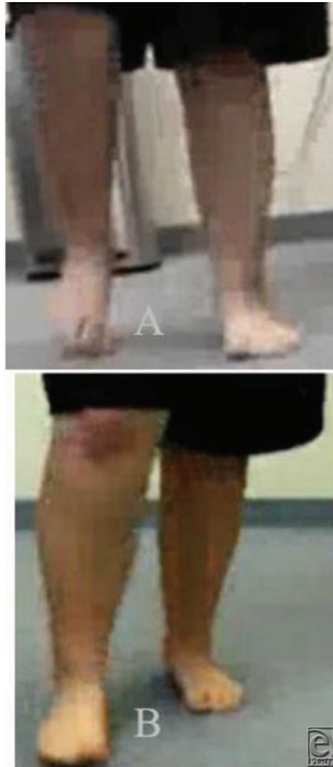
Figure 3b. Continued.