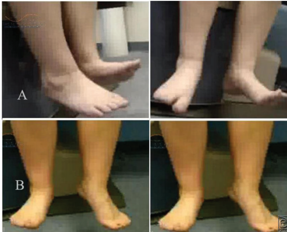
Figure 3. (a) A 16-year-old female patient with right peroneal nerve injury and foot drop resulting from motor vehicle accident. Upper panel (A), right foot: Unable to dorsiflex (BMRC 0/5) the ankle before surgery. Lower panel (B): Gained significant dorsiflexion (BMRC 4/5) after surgery (peroneal nerve decompression, microneurolysis, neuroplasty, and nerve transfer). (b) Upper panel (A), right foot: pathological or neuropathic gait before surgery. Lower panel (B): No steppage gait after surgery.