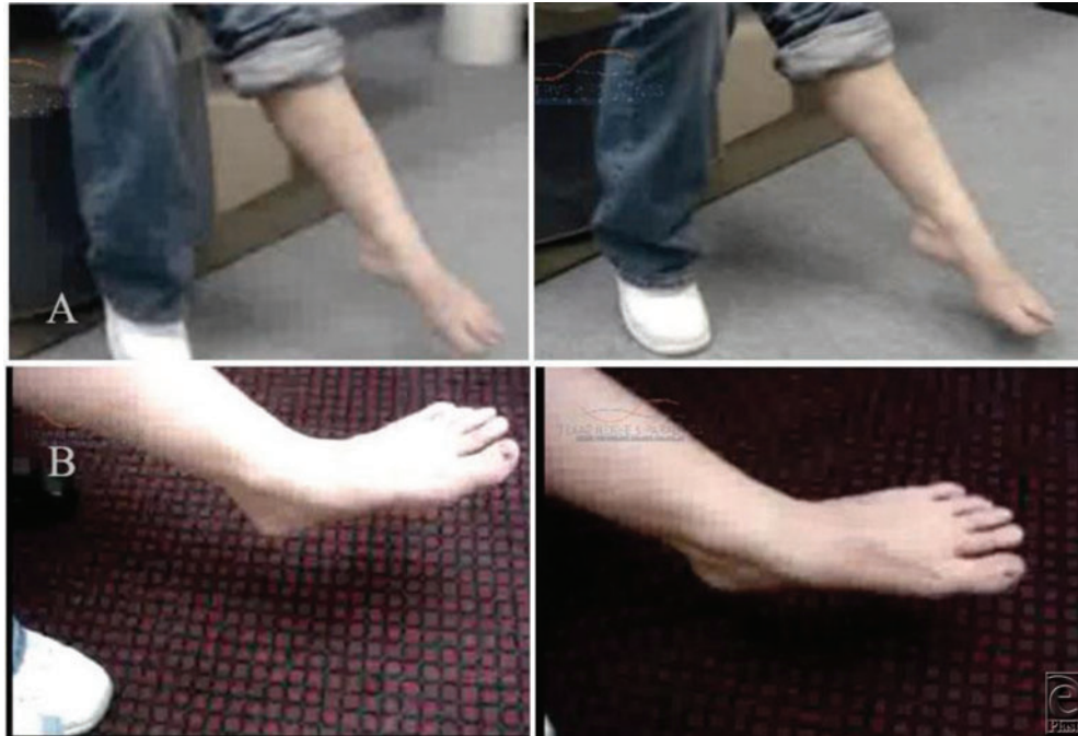
Figure 2. (a) A 26-year-old female patient with left peroneal nerve injury and foot drop resulting from back surgery. Upper panel (A), left foot: No ankle dorsiflexion (BMRC 0/5) and toe extension (BMRC 0/5) before surgery. Lower panel (B): Full recovery of ankle dorsiflexion (BMRC 4+/5) and significant improvement in toe extension after surgery (peroneal nerve decompression, microneurolysis, neuroplasty, and nerve transfer). (b) Upper panel (A): Abnormal walking gait before surgery. Lower panel (B): Improved normal walking gait after surgery.

treatment strategies and compared specifically our previously published article in nerve transfer in patients with foot drop.