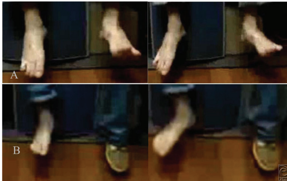
Figure 1. (a) A 24-year-old male patient with right peroneal nerve injury and foot drop resulting from anterior cruciate ligament repair (per patient). Upper panel (A), right foot: The patient was unable to dorsiflex the ankle (BMRC 0/5) before surgery. Lower panel (B): Significant improvement in ankle dorsiflexion (BMRC 4/5), toe extension, and eversion after surgery (peroneal nerve decompression, microneurolysis, neuroplasty, and nerve transfer). (b) Upper panel (A): Steppage gait before surgery. Lower panel (B): The patient was able to walk without slapping or tripping of the foot after surgery.